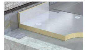
Typical Installation - Concrete Deck