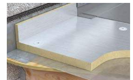
Typical Installation - Timber Deck