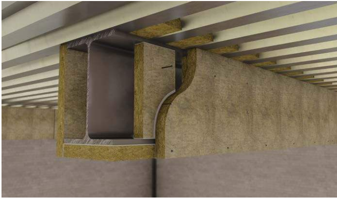
Figure 4 - Glue-fixed noggins and board-to-board glued joints (Up to 4 hours fire protection)

Stud welded pins and board-to-board glued joints Pins are stud welded at max. 320mm centres to top flange and to bottom flange. All board-to-board joints are glued and nailed.