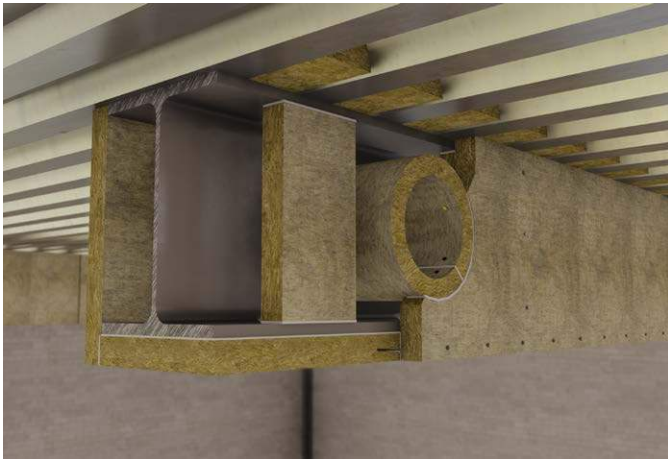
Figure 7 - Beam with circular holes (boxed protection - glued and pinned joints)