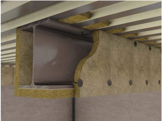
Figure 2 - Stud welded pin dry joint board system (Up to 3 hours fire protection)

The stud welded pins are fixed at max. 320mm centres to top flange and to bottom flange.