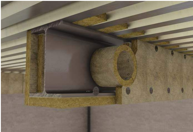
Figure 9 - Beam with circular holes (boxed protection - dry joints)