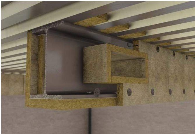
Figure 10 - Beam with square or rectangular holes (boxed protection - dry joints)