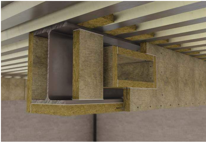
Figure 8 - Beam with square or rectangular holes (boxed protection - glued and pinned joints)