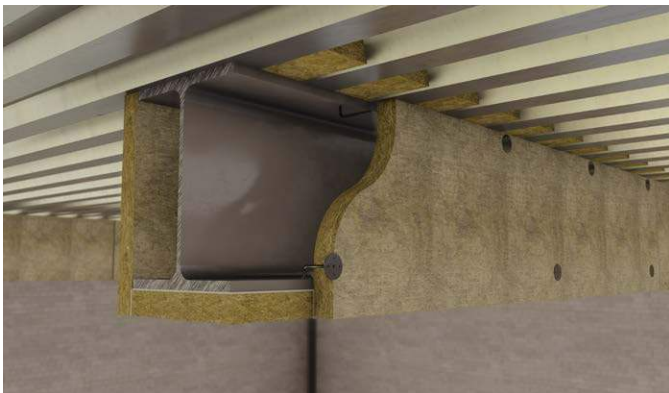
Figure 5 - Stud welded pins and board-to-board glued joints (Up to 4 hours fire protection)

FIREPRO® Glue is an inorganic, non-toxic product with a pH of 11. FIREPRO® Glue is supplied pre-mixed in 17kg tubs. A variety of joint types can be used (see previous page).