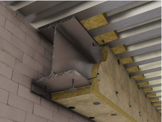
Figure 3- Two-sided protection with stud welded pins (Up to 3 hours fire protection)